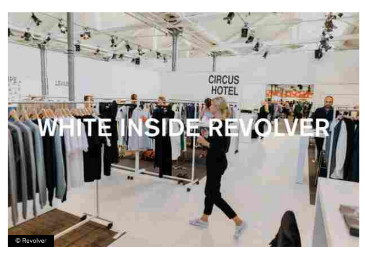
White Inside Revolver

On top of the show's ground floor, CIFF's 1st and 2nd floor will offer permanent showrooms and a shoe fashion show (on Thursday, 2pm). The offer will be rounded up with trend and retail talks organized by Pej Gruppen (ground floor, stand B6-022A).