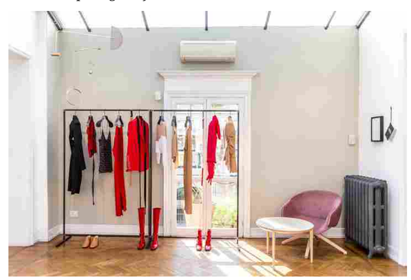
White@Archiproducts Milano: where fashion and design meet