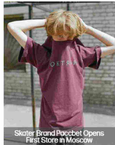
Skater Brand Paccbet Opens First Store in Moscow