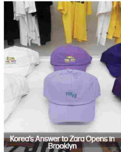
Korea's Answer to Zara Opens in Brooklyn

The next edition of White will also see the participation of Fiorucci, which, as special guest of the trade show, will present its spring 2019 lineup in a dedicated area at the Tortona 27/Superstudio Più venue.