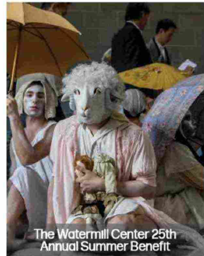
The Watermill Center 25th Annual Summer Benefit