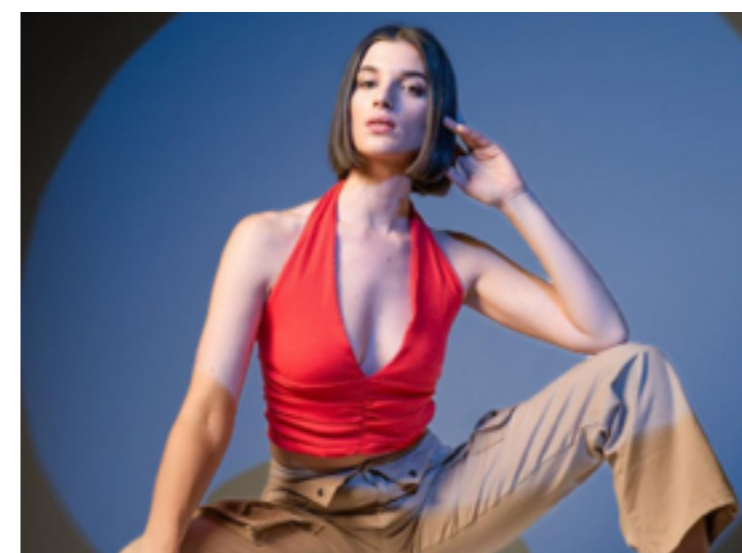
10 Ethical Fashion Brands Giving Back