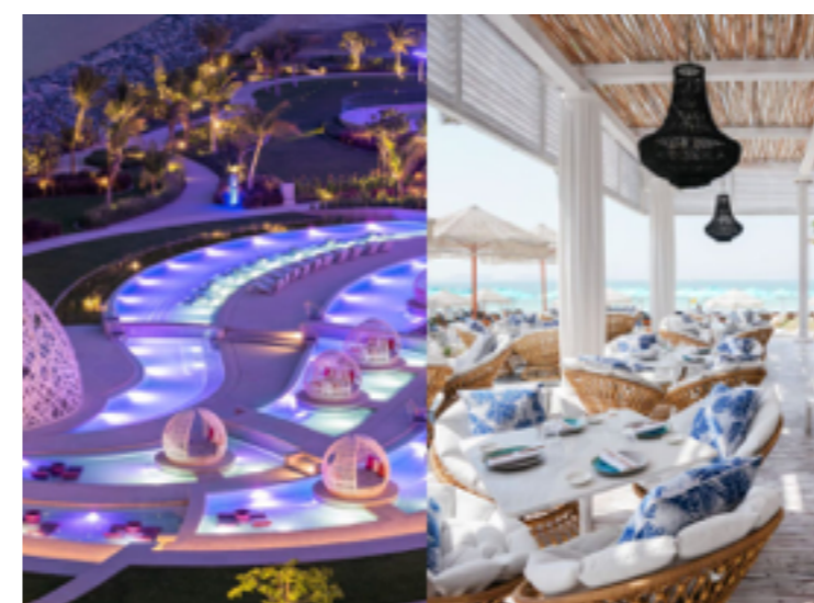
14 Amazing Things To Do In Dubai This June