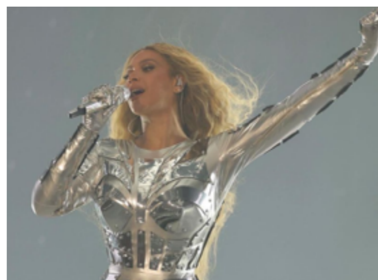
Beyoncé Dons All-Black Designer Tour Outfits In Honour Of Juneteenth