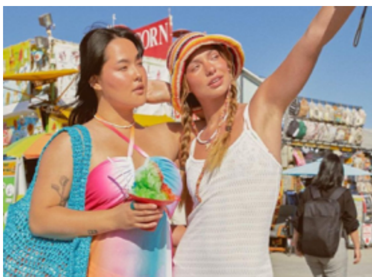
This Fashion Brand Is Every Gen Z Girl's Dream