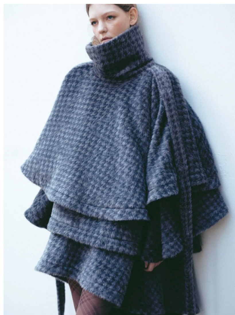
Viktoria wears a coat by BATAKOVIC and tights by CALZEDONIA