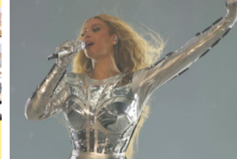
Beyoncé Dons All-Black Designer Tour Outfits In Honour Of Juneteenth