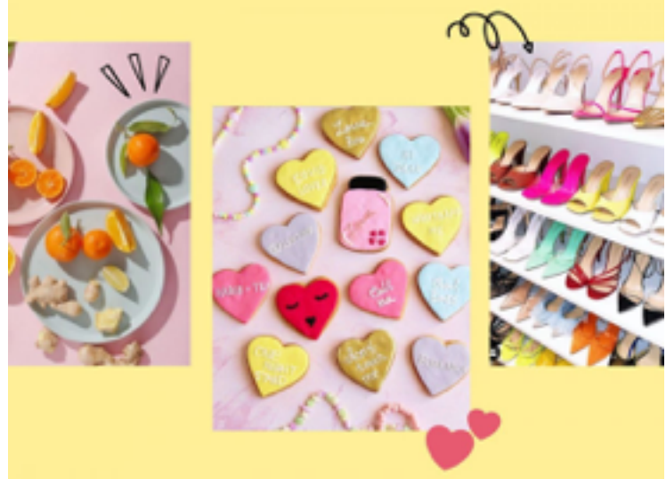
Female-Owned Businesses To Support In The UAE